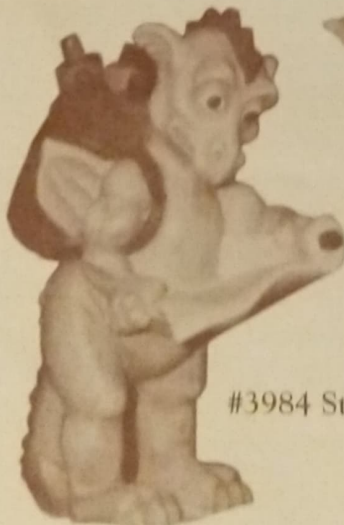
#3984 Step Two