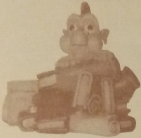
Style # 3970