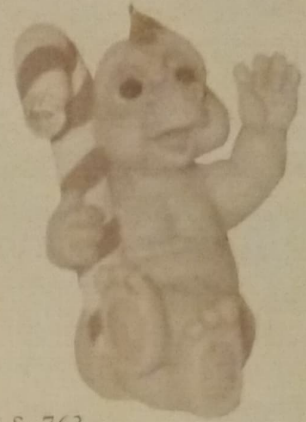
Style # 762 & 763