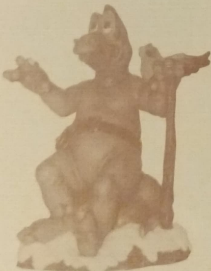
Style # 3969