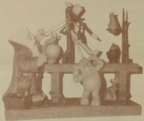
Style # WC2