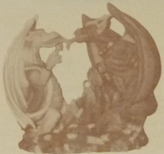
Style # 4003