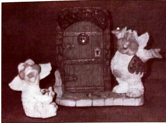
1998 Retirees – Poffles & Triumph pictured with the retired Gateway