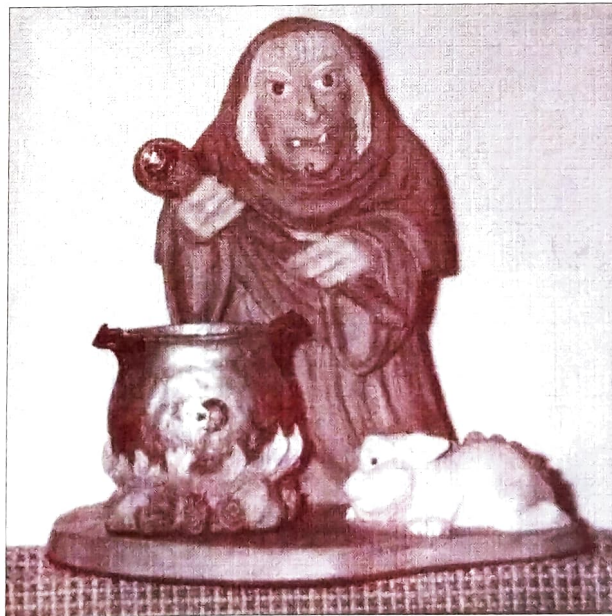
The Bahl pictured with the Cauldron set in place

We have had some collectors who said they did not receive their Collector's Club redemption form so they could purchase Almost There, last year's redemption figurine. To correct this problem, please contact the Club at Krystonia Collector's Club, 125 West Ellsworth, Ann Arbor, MI 48108.