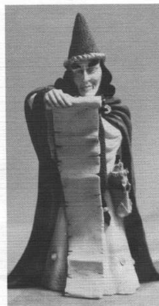
#3811 – Azael