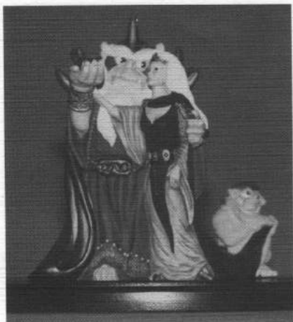
#1109 – Dubious Alliance

Listed below is the first set of retirements for 1995. We expect the stock on these to sell out during the Spring months: