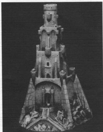
#3203 – Small Tarnhold

This was originally made to go with the mini's, but the mini base already includes it.