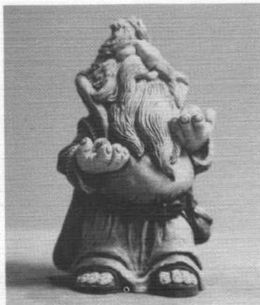
#1703 – Small Rueggan

This figurine was very popular especially on wedding cakes. With the occurrences of the 4th book (due out this year) the Alliance may be no more.