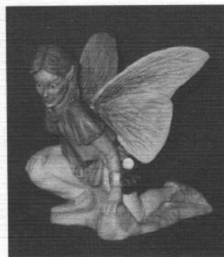
#3912 – Boll

Time to rest the last of the original Rueggan poses. Pictured in original style with two crystals. Later version had crystal in one hand, book in the other.