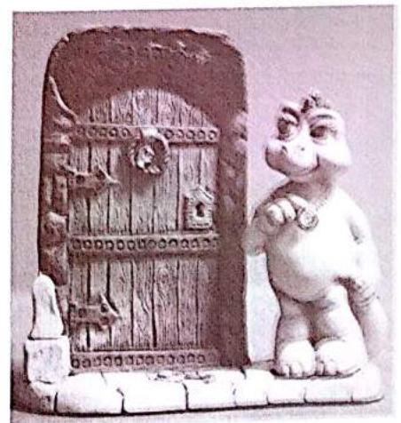
Shadra and Gateway to Krystonia